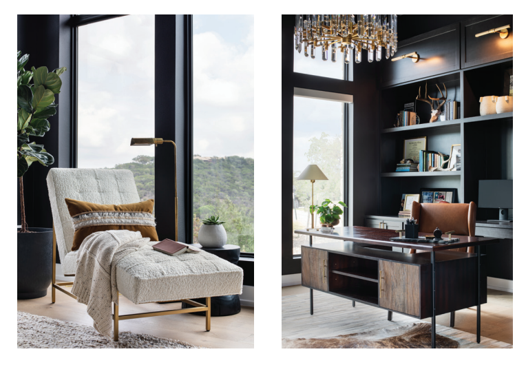
TOP, FROM LEFT: A neutral color palette and abundant natural light bring calm to an open kitchen and dining area. Julie Roberts, RID, ASID, Principal and CEO. Yellow accents liven up a cozy space. MIDDLE: Personalized elements, such as hair on hide chairs, add a rustic touch to an otherwise modern living room. BOTTOM, FROM LEFT: Expansive windows provide insight into the greenery below, allowing for meditative calm. Rich wood, dark walls, and curated novelties contribute to a masculine atmosphere.